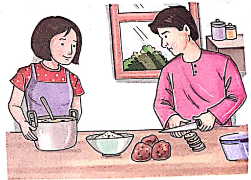
mother cooking food and father helping her

Both knew each other well. They decided to get married. They are now husband and wife. They know each other's likes and dislikes very well. They help each other and have a strong and healthy relationship.